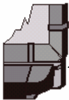
Ready Light on right side of pen tray

The Ready Light indicates the status of your interactive whiteboard. Depending on the model of the SMART Board interactive whiteboard you are using, the Ready Light is located either on the right side of the pen tray or the lower-right of the frame bezel.